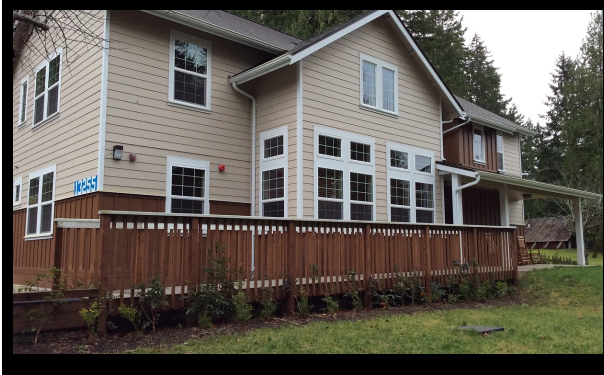
The Huckleberry Lodge

For more information about Seabeck Conference Center, please check out their website: https://www.seabeck.org/ .