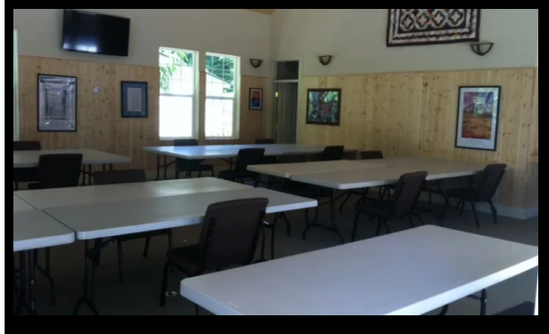
The Juniper Meeting Room (sample layout, we'll customize it!)